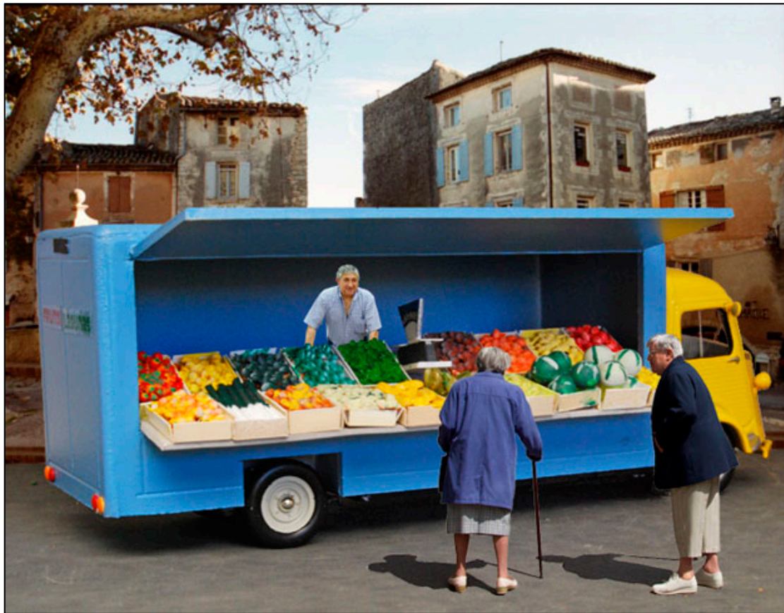
Figure 2. Image showing the Mobile Market Concept